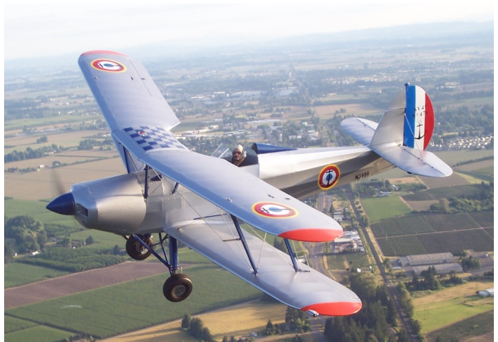
Bob Hoyt's Stampe in England in 1968 (top) and its first flight after restoration in 2006 (bottom). It continues to delight aviators young and old (left).