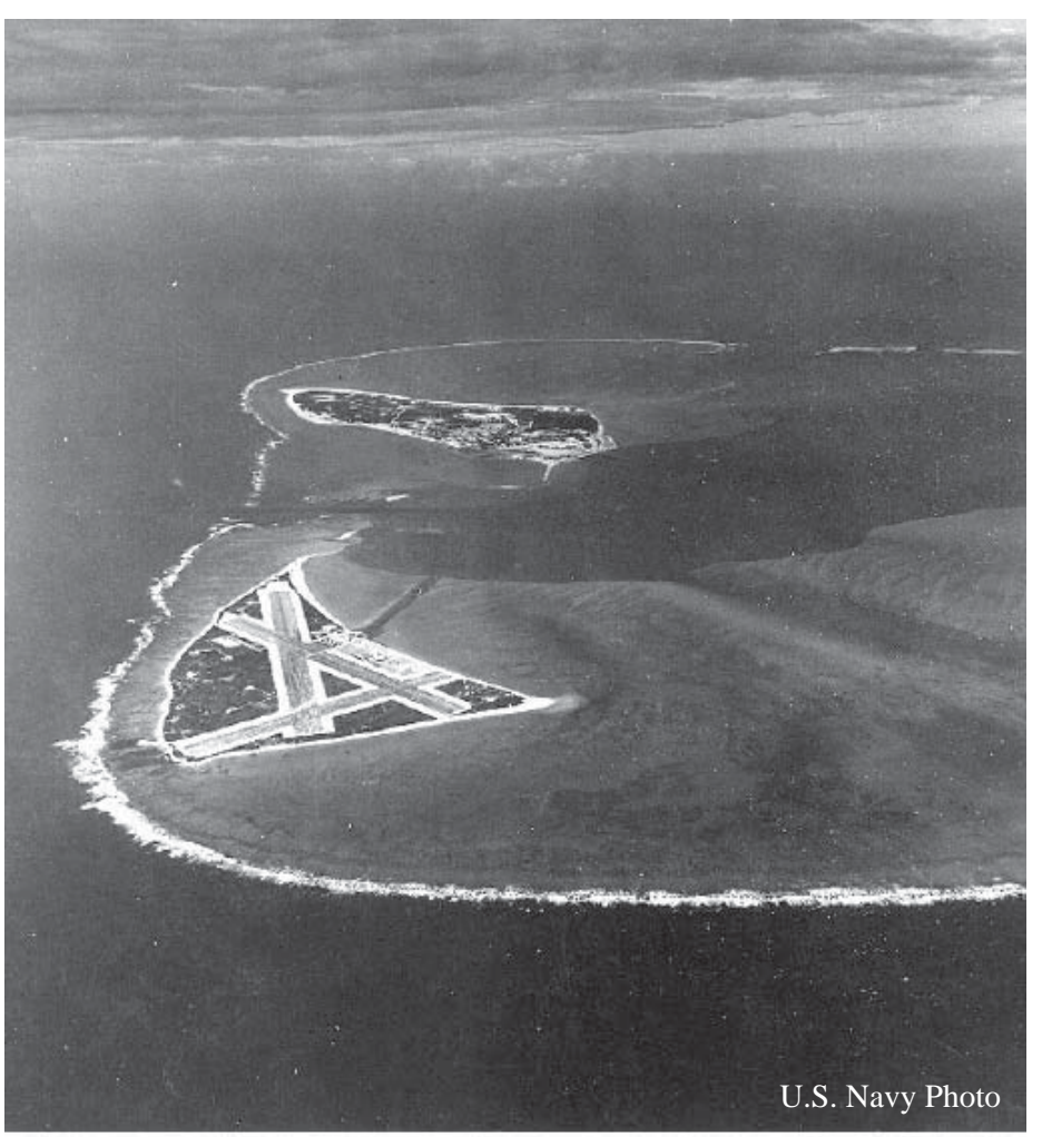
Photo # 80-G-451086 Midway is., with Eastern I. in foreground, Nov. 1941

In the Spring of 1942 Japanese forces were proving to be an unstoppable juggernaut. The Japanese Army and Navy under direction from the Imperial