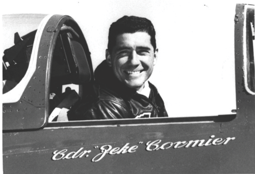
CDR. Richard "Zeke" Cormier

coloring, when you go outside the lines of the picture you can throw your initial attempts at artistry away and start again. Whereas in flying you must always stay within the lines defined by the aerodynamics of the particular aircraft you are operating. When learning to fly, you explore, with an instructor, those boundaries that define the limits of your aircraft. Although, I have read about some younger pilots that have never practiced