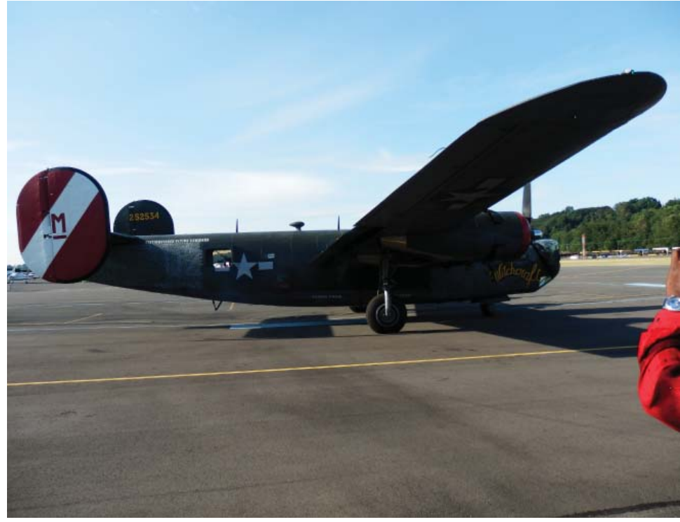
B-24 Witchcraft

places and we were all required to be in these positions for landing and takeoff. Basically, there were no good seats for landing and takeoff. However, as soon she was out of the pattern, they would ring the bailout bell one time, and we would be free to explore the entire inside of the airplane. About a half hour later, the bailout bell would ring twice and we would need to go to the nearest seats available and strap in for landing. They specifically said we were allowed to