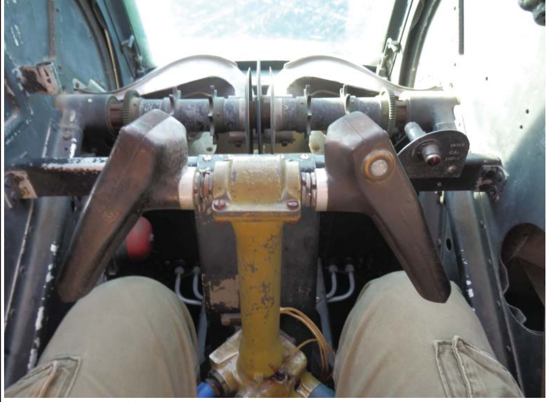
B-24 Tail Gunner Position