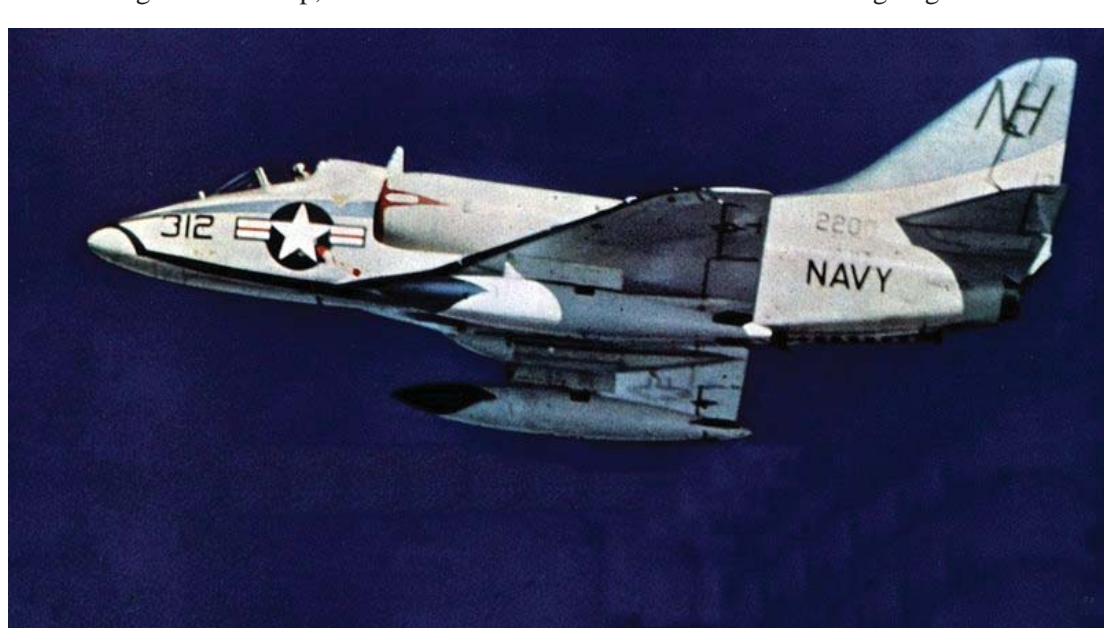
VA-113 Stingers A4D-1 Skyhawk

for "burner now." Other than increasing the noise level, the application of afterburner had little effect as we were too slow and too high to make any appreciable difference. With only our