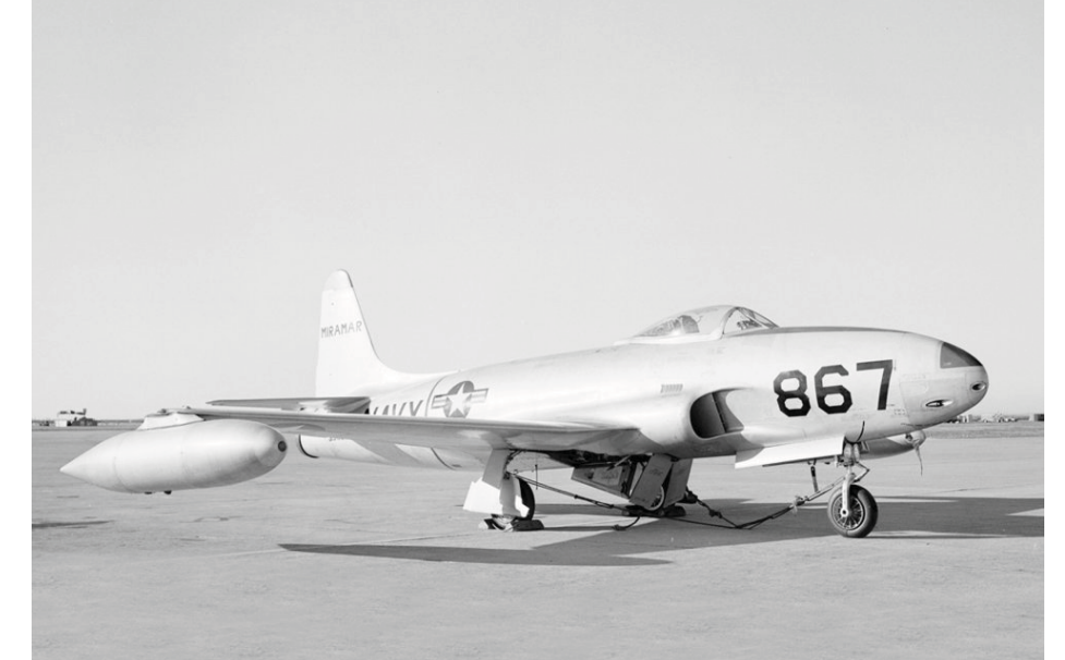
A TV-1 Shooting Star assigned to Naval Air Station (NAS) Miramar, California, pictured on the ground at the station.

Driving alone from Texas to California was both hot and dusty. My four-window air conditioning was maxed out and the gritty desert sand blew in the open windows as I consumed my favorite hot weather drink, a lukewarm orange soda. Even with the long hot trip,