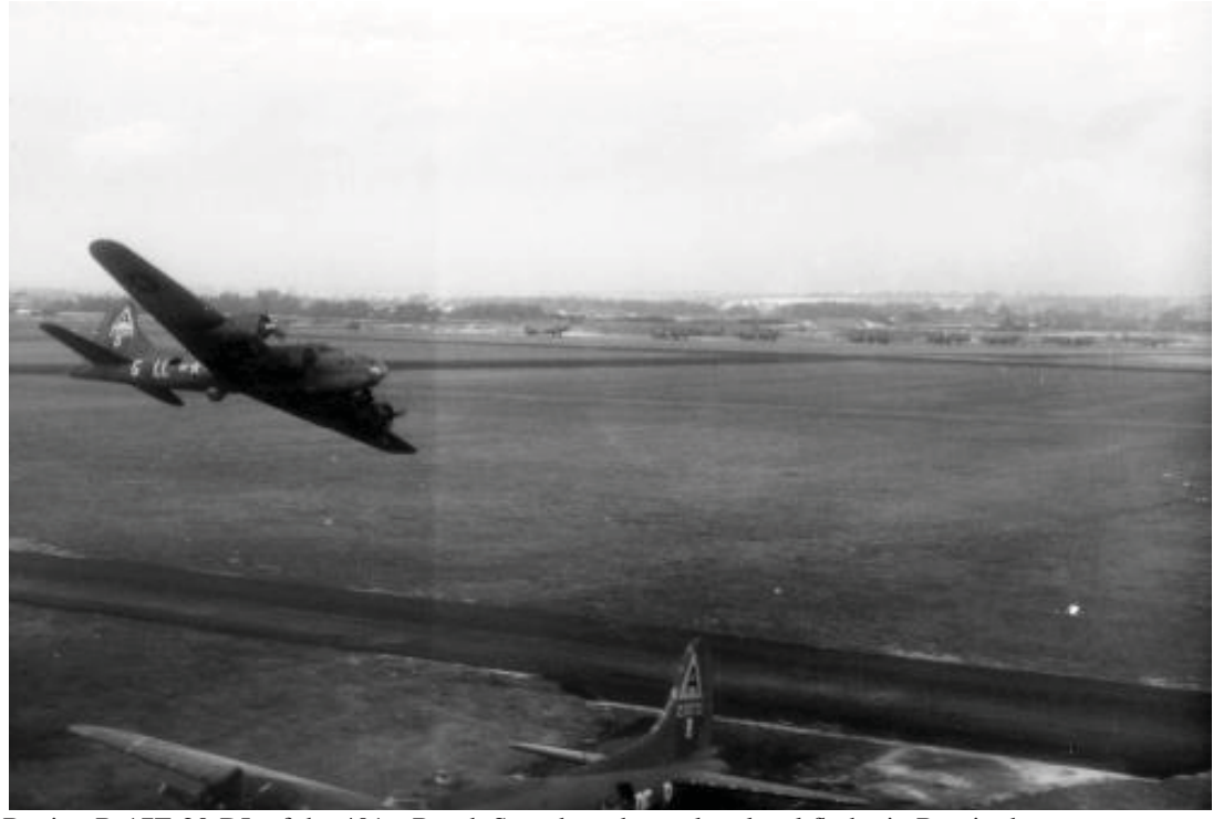
Boeing B-17F-20-DL of the 401st Bomb Squadron does a low level fly by in Bassingbourn, England.