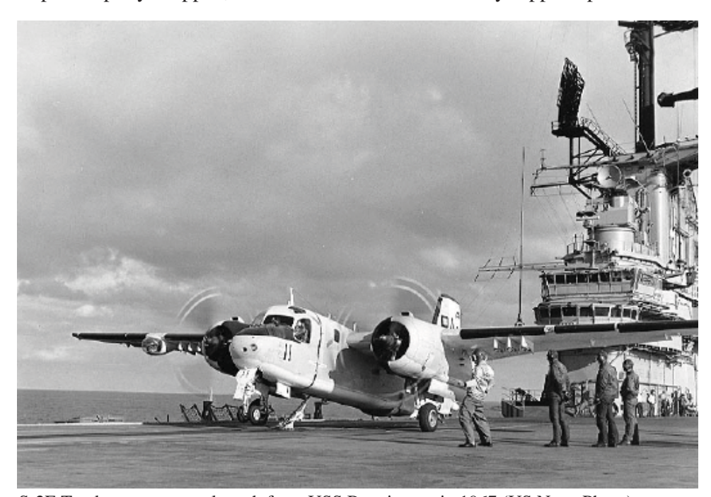
S-2E Tracker prepares to launch from USS Bennington in 1967