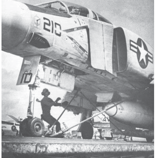
F-4B preparing to launch

We took 1,000 pounds of fuel from an A-3 tanker on the return flight, landed aboard and got debriefed. One of the air intelligence debriefers seemed upset with the report that I had jettisonned the highdrag rocket pod rather than expending all of my ordnance at the target. I thought, gee, I should have just fired the damned things blind on the last pass, and then