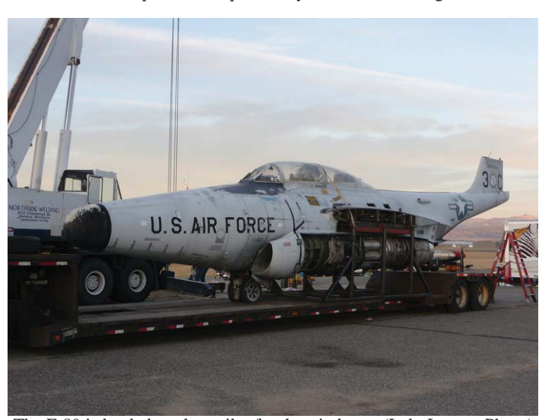
The F-89 is loaded on the trailer for the trip home

this whole production was taking place, was filming the team's efforts. Both Dave and I were not only tasked with recording the event, but lending a hand with the disassembly as needed. Well this was going to be an all hands on deck day for sure. We all arrived onsite at 0700 and began the final preparations to remove the wings. The weather was beautiful and, in the span of six days, the daytime temperatures had gone from the teens to 60's. By 0900 the much anticipated larger mobile crane had arrived and the Scorpion was being prepared for the lift. By 1000 the Scorpion was suspended beneath the crane and Hal and Einar worked to separate the left wing. After an hour tugging and prying at the joint between the wing and the fuselage, it was discovered that we had missed three rows of bolts buried inside the wing behind a fuel cell. It seemed that the Scorpion had stung us once again. By 1200 the left wing was off and we were making plans for the