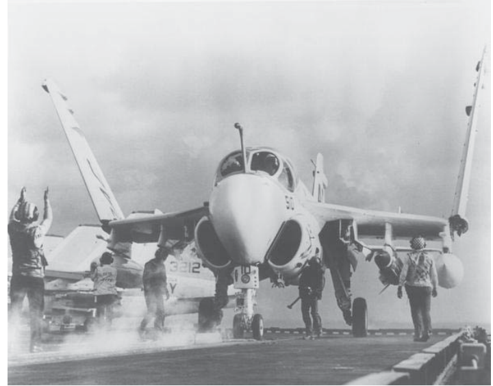
A-6 unfolding its wings as it moves to the cat.

something really effective, like mining Haiphong harbor for instance, that the Chinese would enter the conflict as they did in Korea and the U.S. would then have a much bigger war on its hands. The result was that the air