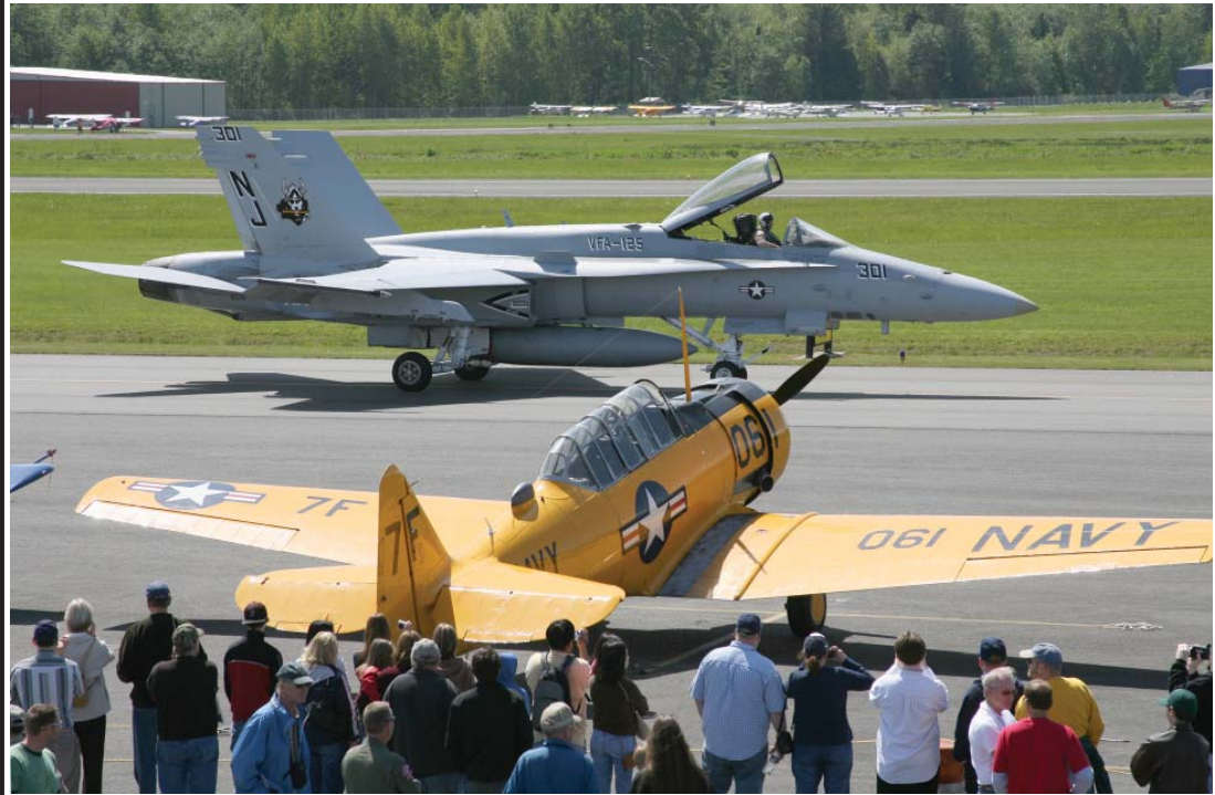
An F/A-18 Hornet from the West Coast Demo team out of Lemoore, CA taxis to the active at Skagit Regional Airport in 2007.