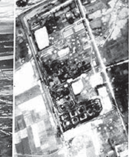
Strike photo via www.HistoryCentral.com

We all felt that we had at last accomplished something on a significant target, and had put a crimp in the